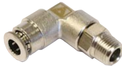
6mm elbow (Connection to machine)